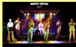
North Tower Saturday Night