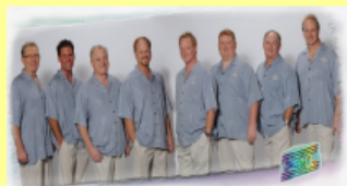
Band of Oz Saturday Noon

WPCM 95.1 FM 920 AM The Sound of Alamance County