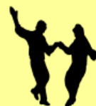
Wood dance floor

Special rates at area motels (see website)