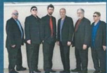
Sunday: Holiday Band