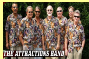
The Attractions Saturday Afternoon