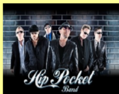
Hip Pocket Friday Night