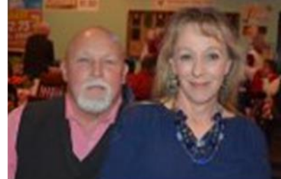
More Christmas Party Fun - Showtime Lounge - 2018