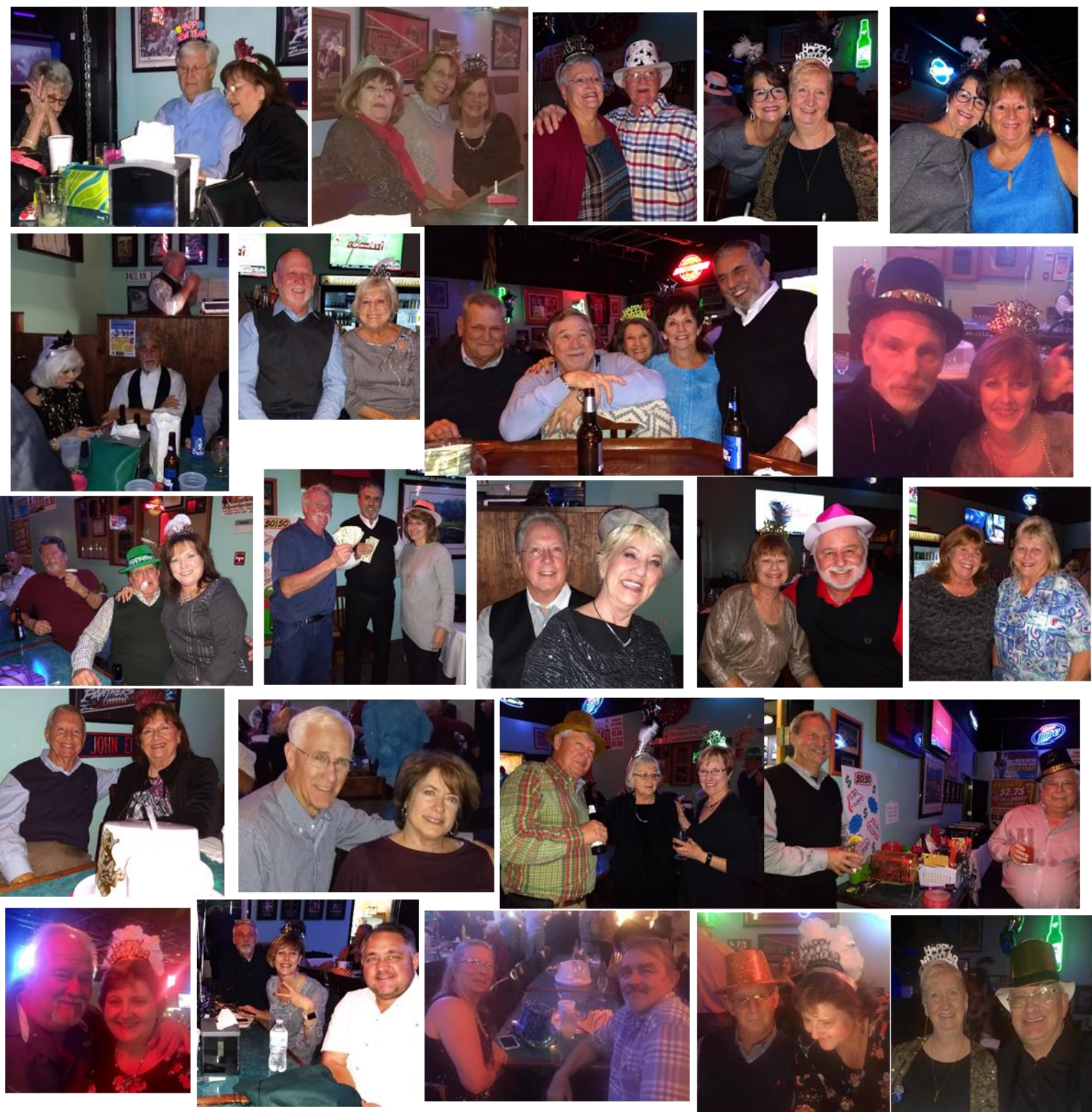
New Year's Eve Party – What a Fun night! Great times with great friends!